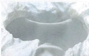
Absorbs into Decay