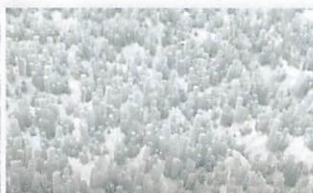
Assembles in Decay